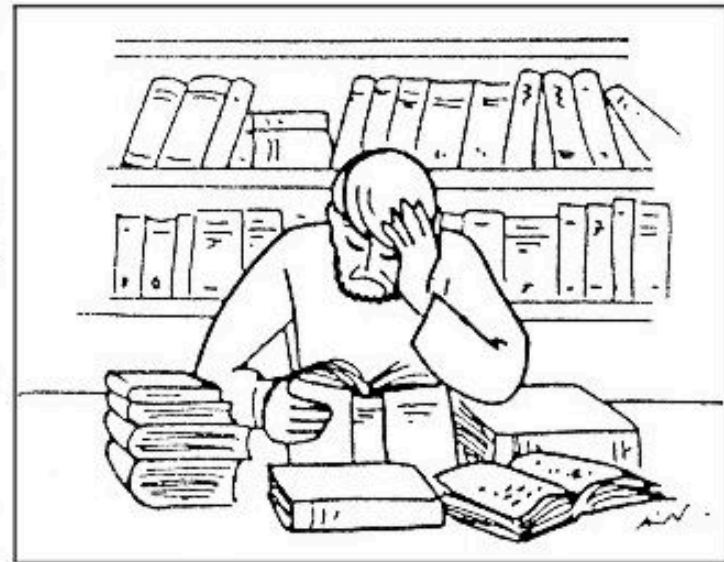
Philosophy cannot satisfy

Indeed, Allah, glorified and exalted, is a reality – not a product of people's imagination or fantasy. We cannot comprehend how Allah exists, for our understanding is limited. Allah is Spirit, and because our vision is finite, we cannot see Him. He is present in every place and in every age. Allah is eternal. He has absolutely no beginning or ending whatsoever. And Allah is